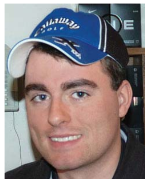
Ciaran Nienow Pro Shop