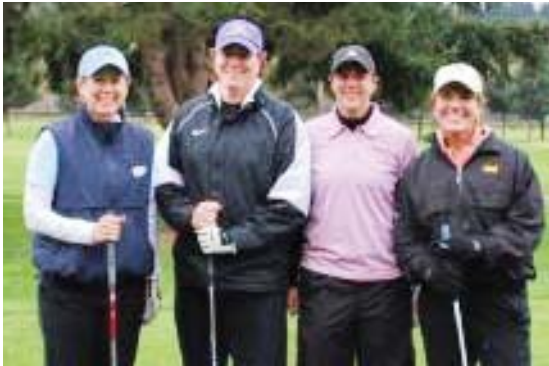
These photos are from the Spring Fling.